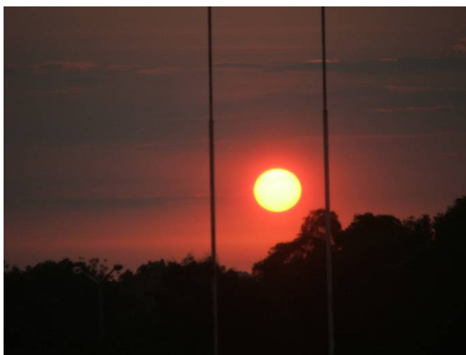
Another view of dry season rugby