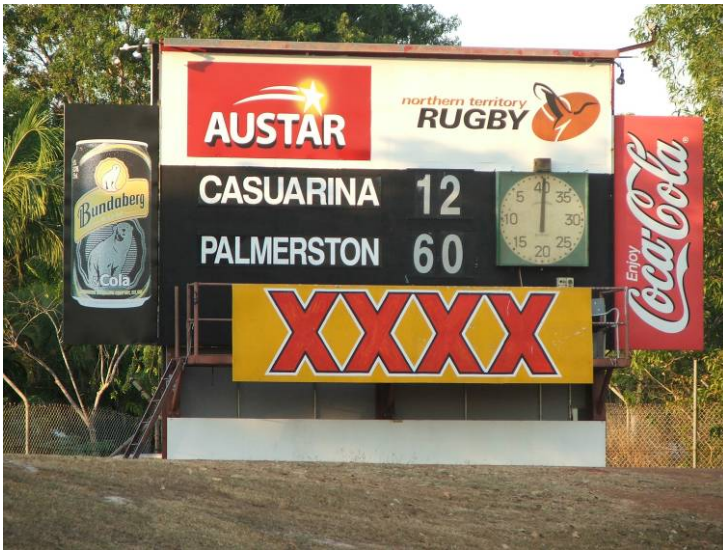
This should gladden a few hearts