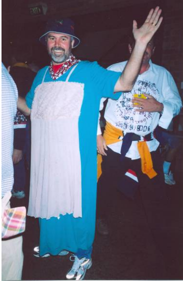
And who is this handsome gent obviously enjoying the cross-dressing?